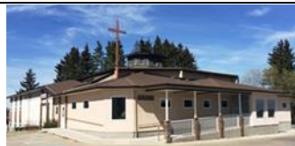
Rocky Mountain House